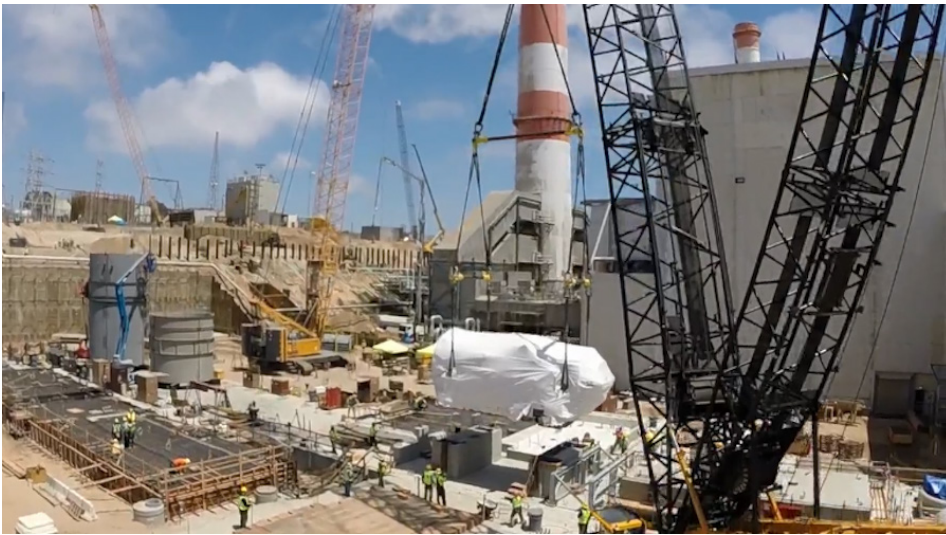
The Scattergood project

A big jury award leads to a big contested interest payment